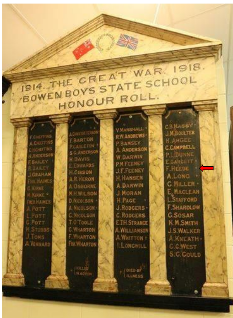
Bowen Boys State School Honour Roll