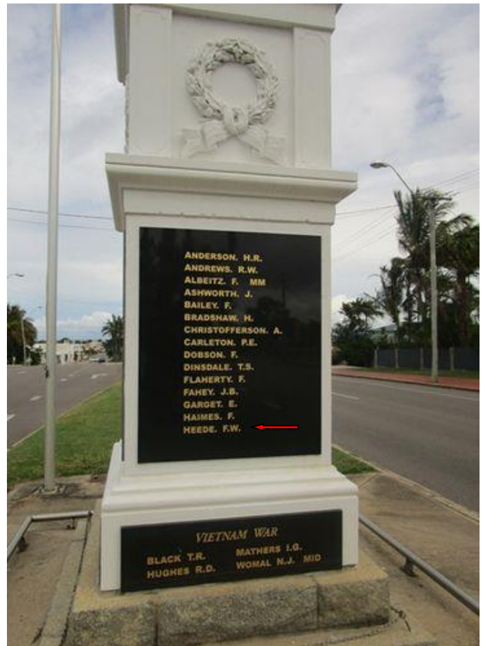
Bowen War Memorial